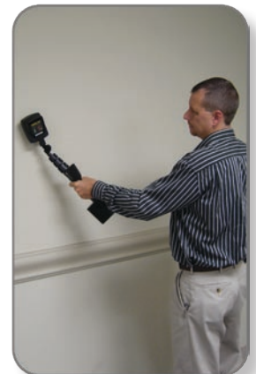
Telescoping antenna pole retracted.

Input AC: 100-240 V, 50-60 Hz Run Time: >8 hours per battery (typical) Charge Time: 2.5 hours per battery Batteries: Lithium Ion Rechargeable Battery (2 included)